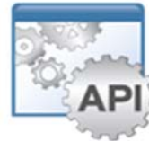
Integration API's Support