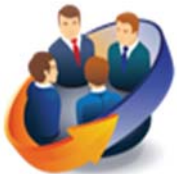
Real Multi-Users Application