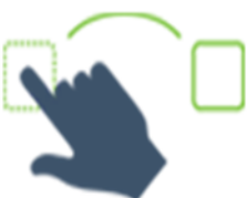
Form Designing (Drag / Drop)