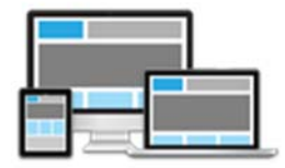
Tab & iPad compatibility