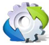
Functional Level Access